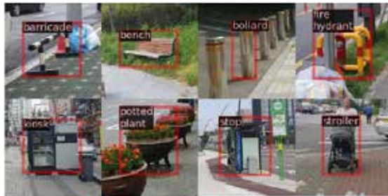
Fig 2: example of distinct objects. Such objects are often encountered on sidewalks and could be obstacles for impaired people