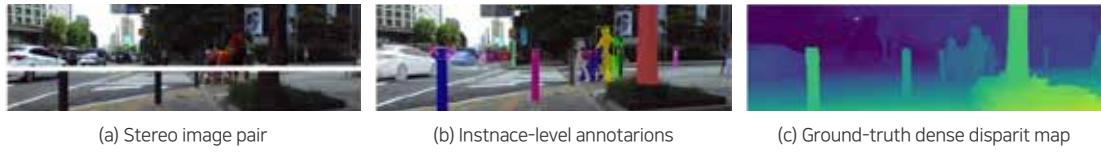
Fig.1 : an example image-pair and annotation of a sidewalk. (a) Stereo image pair captured by a ZED stereo camera (top and bottom images indicate left and right images, respectively), (b) instance-level bounding box and polygon mask annotations in the left image, and (c) The ground-truth dense disparity map.